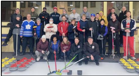
Learn to Curl Class, Winter 2022