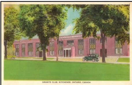
Granite Club at 69 Agnes St, Kit.