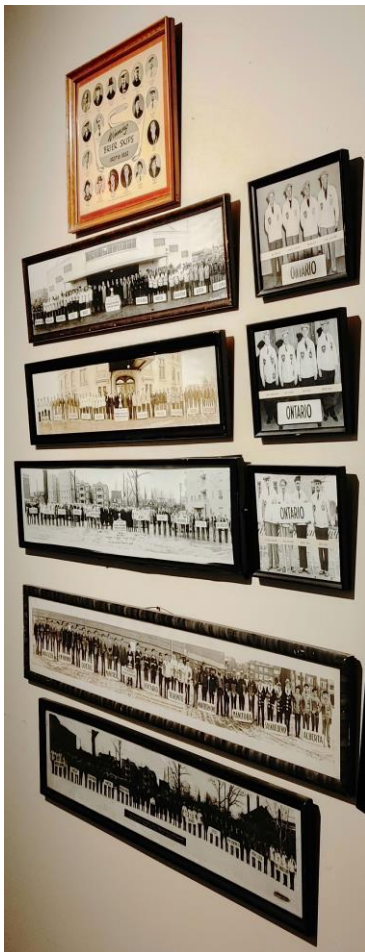
KWGC History Corner