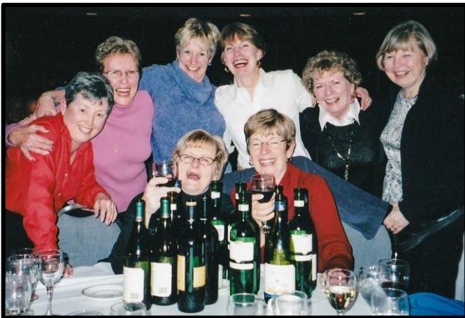
Friday Night Banquet with the Niagara Falls Team